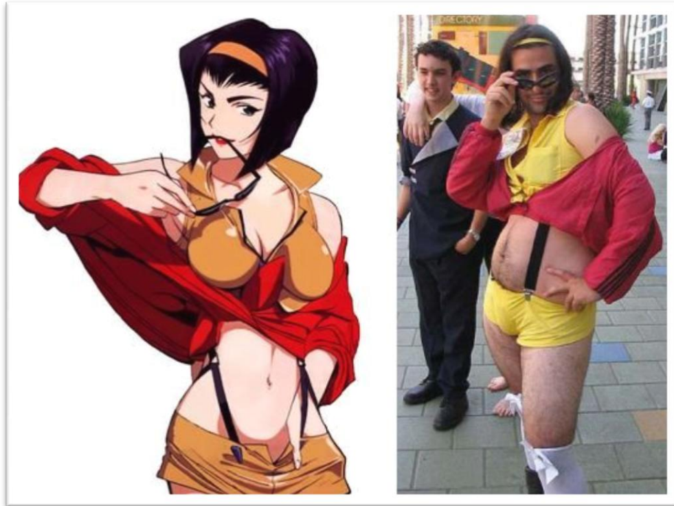
Figure 3: “Man-Faye” crossplay of Faye Valentine from Cowboy Bebop