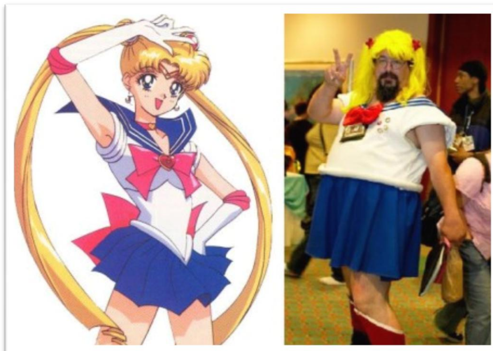
Figure 4: “Sailor Bubba” crossplay of Sailor Moon from Sailor Moon