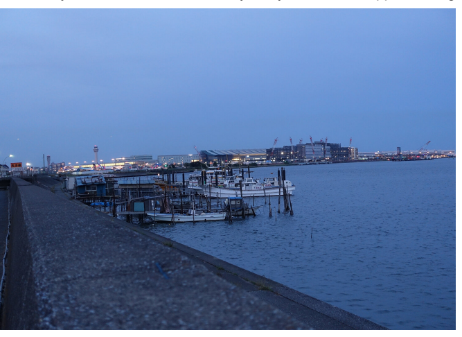
Flanked by the Tokyo skyline--with its ubiquitous landmarks and Haneda Airport--you may feel as if you are embarking on a day of fishing from one of the most unlikely places in the world.