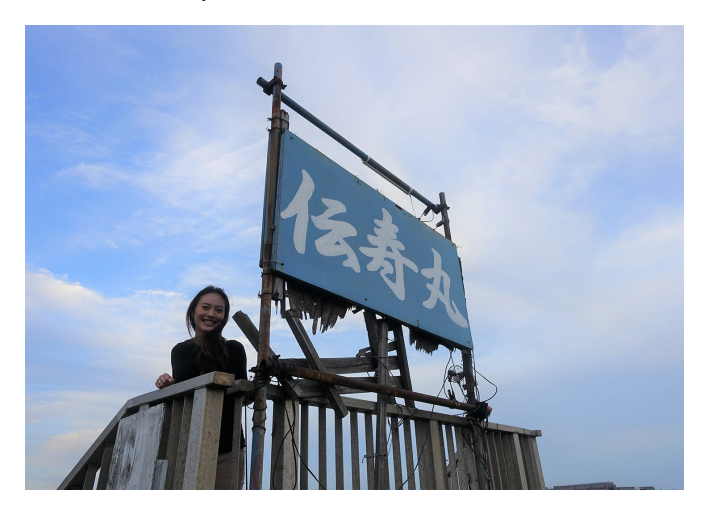
Standing on the dock under blue skies, musky sea breeze setting the mood, it is hard to believe a dense, enormous urban center is a mere 15 minutes' drive away.

Fish for your own fresh catch in Tokyo Bay! | Site to Support Foreign Residents' Life in Tokyo Denjyumaru, located in Haneda, is one such operator. They have been providing fishing tours for almost 30 years from the same location in Ota City.