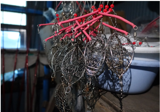
Specialized equipment used to catch aji (horse mackerel).