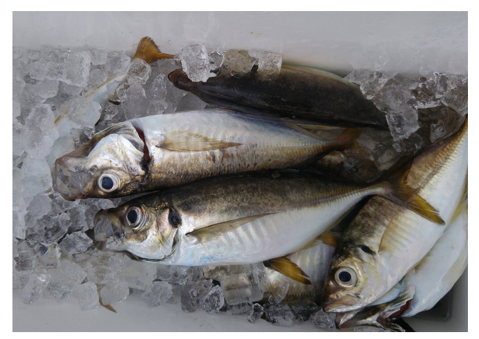
Fresh catch of aji (horse mackerel) from Tokyo Bay.

Fish for your own fresh catch in Tokyo Bay! | Site to Support Foreign Residents' Life in Tokyo at just ¥500. Enomoto has a wealth of knowledge about fishing gear, and can help beginners and experienced anglers alike. Of course, if you have your own preferred gear, bring it along.