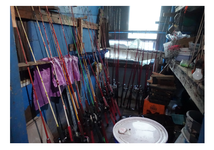
Another great thing about Denjyumaru is that you can show up empty-handed. Just bring your determination and an adventurous spirit! Everything else can be rented when you arrive. A large selection of fishing rods and other equipment is available starting