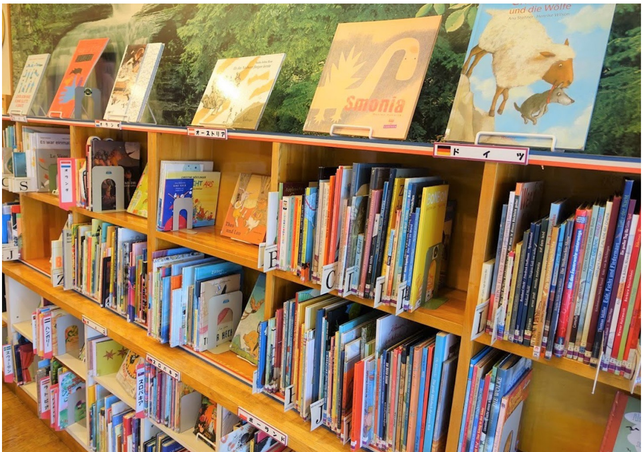
Books are organized by their country of origin.