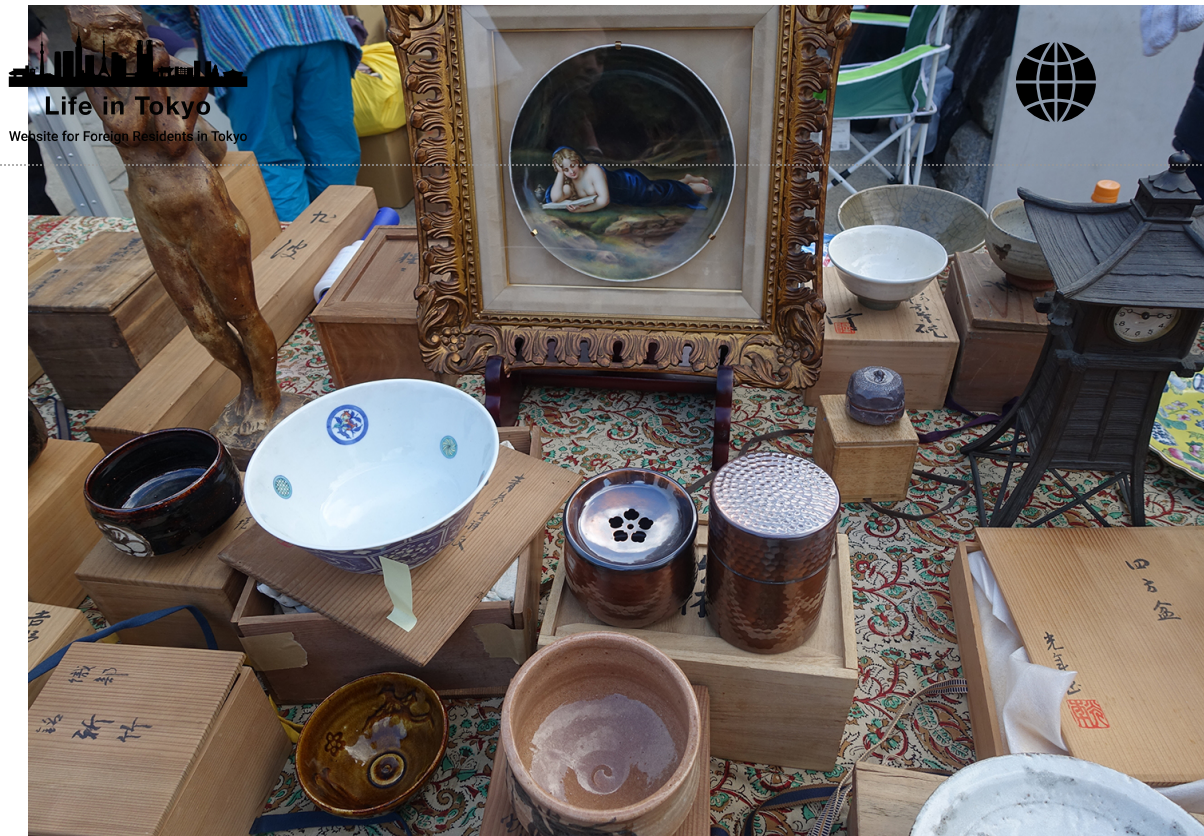
A mixed selection of small furniture and ornamental pieces for decorating the home are also up for grabs.