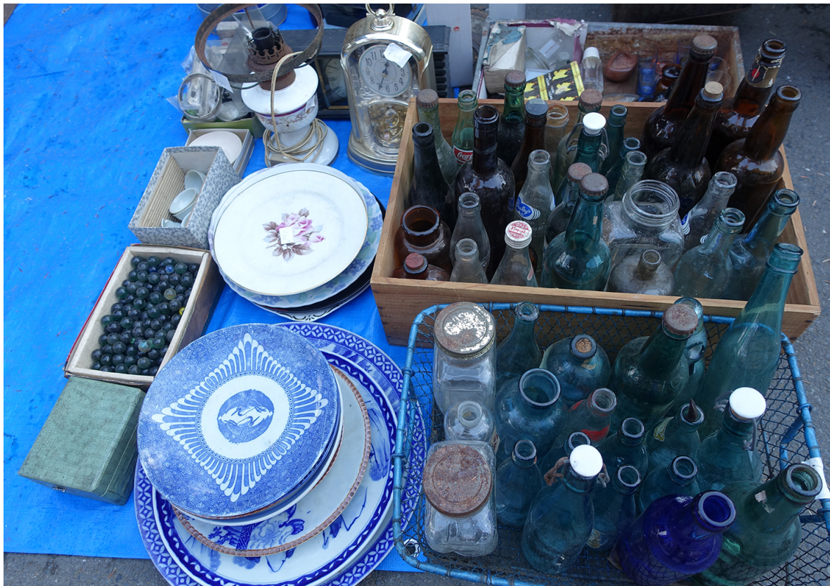
Alternatively, one could get creative with boxes of recycled glass bottles and jars too.