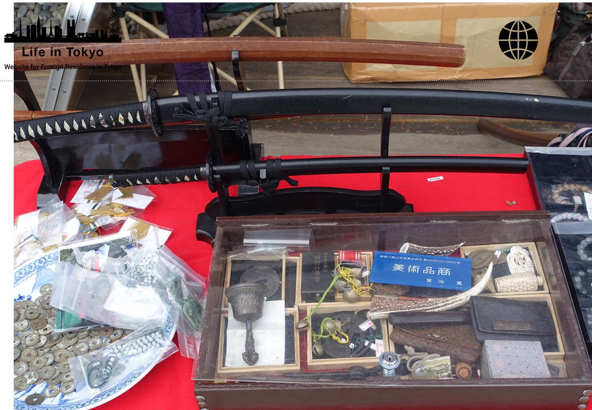
Several stalls offer old katana swords, record players, ancient coins, teapots and even occasionally military memorabilia for sale.