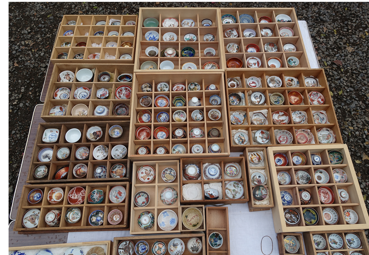
Have a field day picking out your favorite porcelain bowls, plates or cups from amongst hundreds of different designs and sizes!